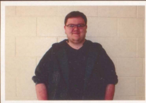
Most Likely to be a Famous Artist